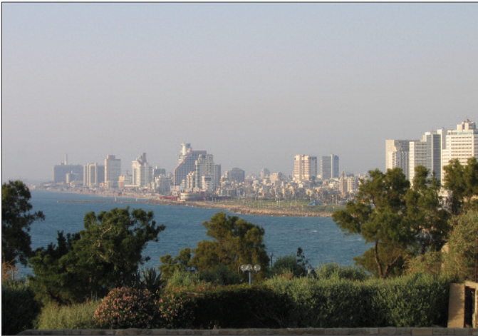
Tel Aviv, from the ancient port of Jaffa

This is what the Lord says: “Stand at the crossroads and look; Ask for the ancient paths, Ask where the good way is, and walk in it, And you will find rest for your souls.” (Jeremiah 6:16)