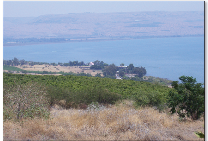
Sea of Galilee, viewed from the Mount of Beatitudes