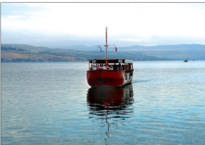
Boat Ride and Fellowship on the Sea of Galilee