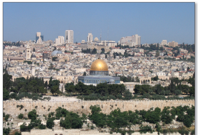
Temple Mount, viewed from the Mount of Olives