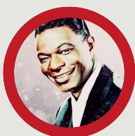
"A CRADLE IN BETHLEHEM" NAT KING COLE