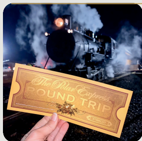
POLAR EXPRESS TRAIN RIDE FROM MT. HOOD OR MT. RAINIER