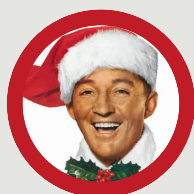
"WHITE CHRISTMAS" BING CROSBY