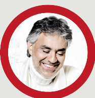
"GOD BLESS US EVERYONE" ANDREA BOCELLI