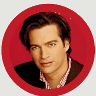
"THE HAPPY ELF" HARRY CONNICK JR.