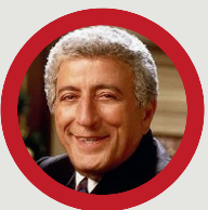
"WINTER WONDERLAND" TONY BENNETT