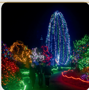
ZOO LIGHTS AT POINT DEFIANCE ZOO