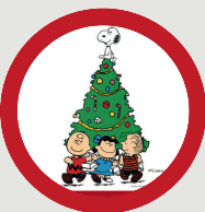
"CHRISTMAS TIME IS HERE" VINCE GUARALDI TRIO