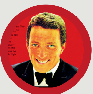
"IT'S THE MOST WONDERFUL TIME OF THE YEAR" ANDY WILLIAMS