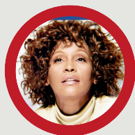
"JOY TO THE WORLD" WHITNEY HOUSTON