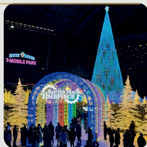
LUMEN FIELD OF LIGHTS