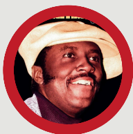
"THIS CHRISTMAS" DONNIE HATHAWAY